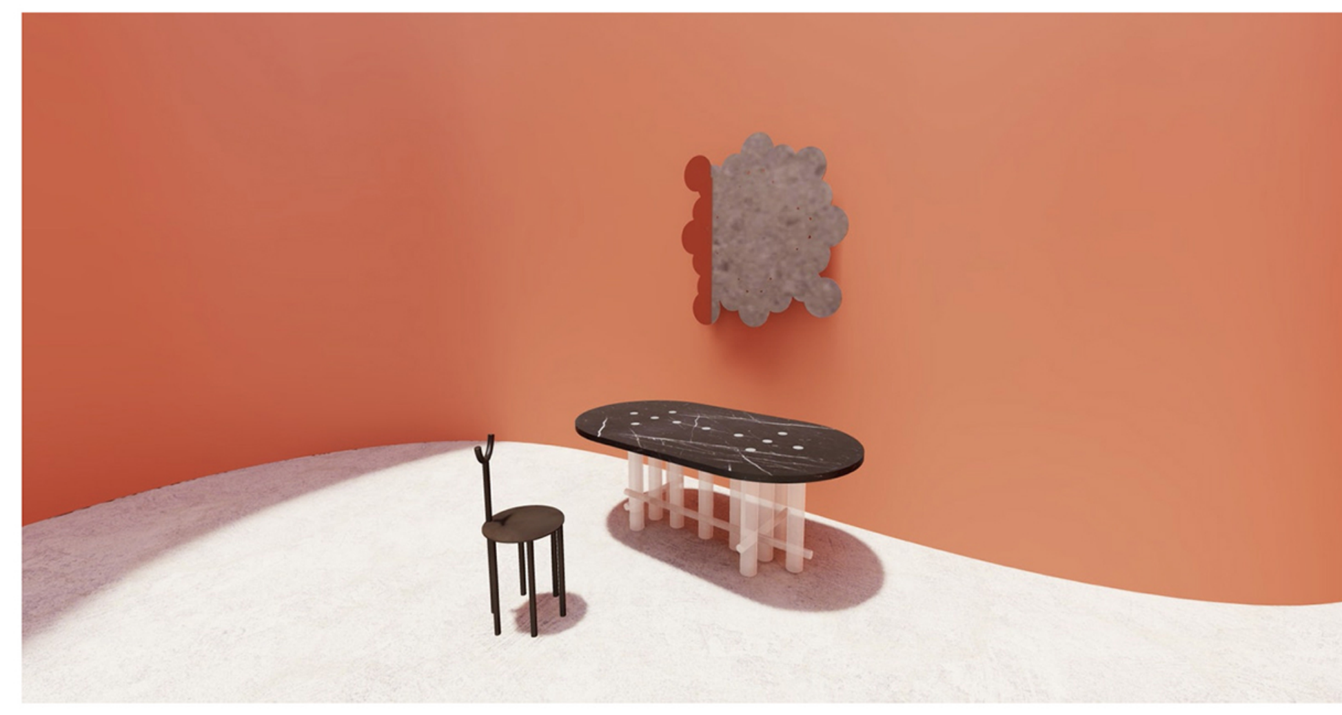
Room for Irregularities Chair by walac., Crux Desk by Sofia Campos Delgado/Estudio SCD, Kit Christo Mirror by Asata.

One of our favorite parts of the exhibition was the way in which working within VR allowed the gallery's designers to create spaces that not only were pleasing to the eye, but also were far more expansive and radical than what typical whitewall galleries usually stage. In one room undulating, deep orange walls curve to frame each vignette, while in another, a massive pink cylinder surrounding the design pieces reaches several stories high toward the open sky at the top of the chamber. As you pass through the gallery, you catch small glimpses of an extraterrestrial landscape just outside the walls, suggesting that there is something otherworldly about the whole experience.