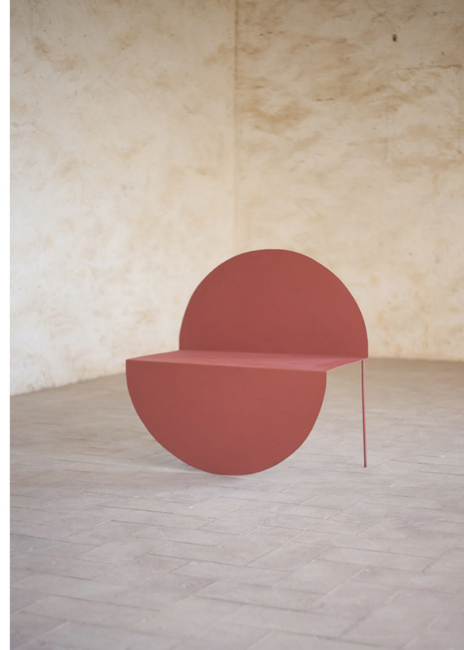
The La Redonda Chair by Bodegon Cabinet makes use of a familiar shape, bending and reconstructing the circle to make a simple yet elegant chair.

It's undeniable that creating virtual exhibitions widens the audience for upcoming designers, especially in the current climate, but Movimento believes, rather than working as a replacement, that virtual exhibitions should be created as complements to traditional physical shows. "We do, however, share the opinion that nothing virtual can ever truly replace the feeling of seeing art firsthand, so we don't expect that virtual exhibitions will replace physical exhibitions but perhaps will work side by side, for some events, to offer something extremely interesting," the studio told Clever.