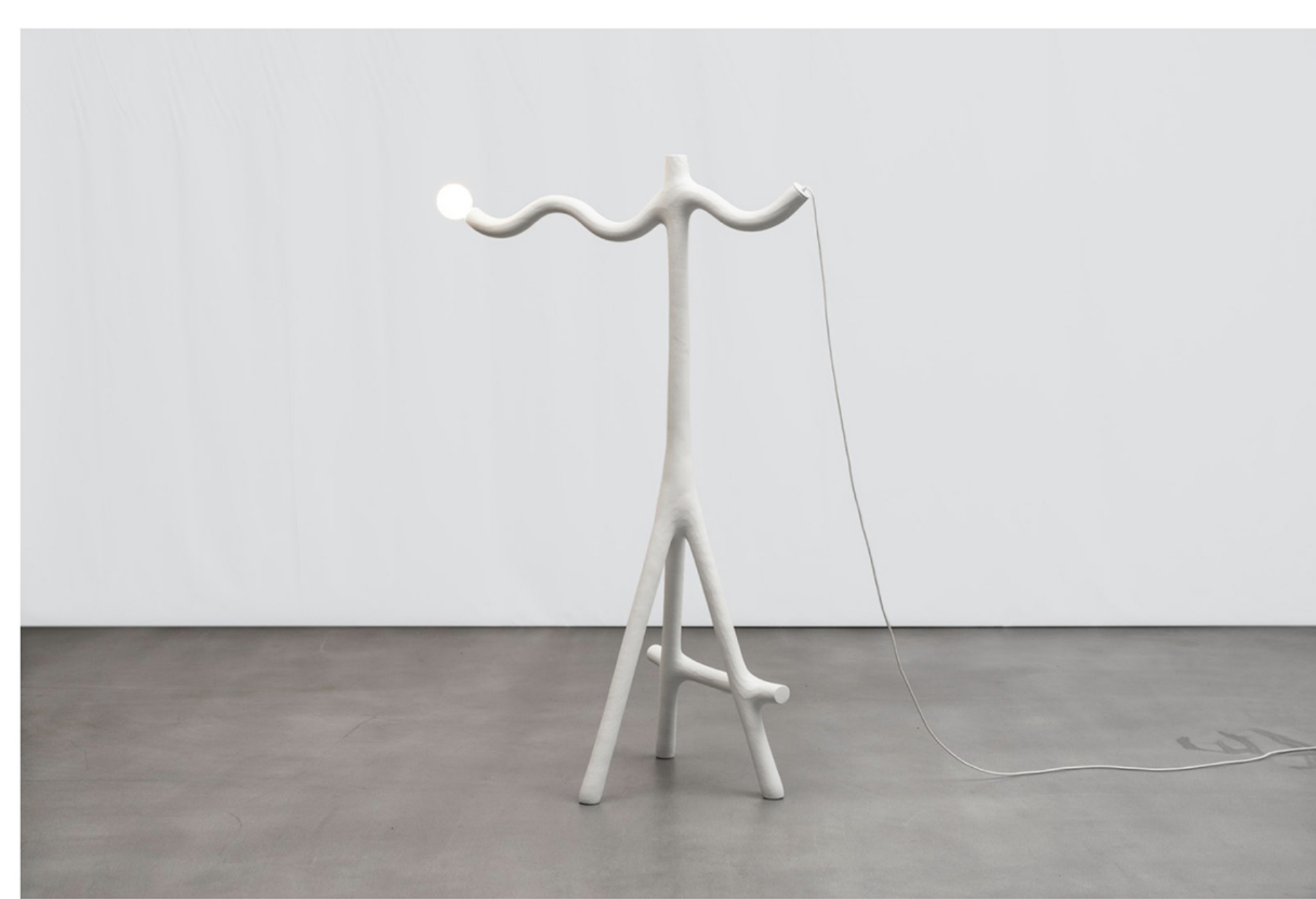
The Wave Lamp on Sticks by Hot Wire Extensions was created using an innovative recycling-conscious manufacturing process in which a wire shape is filled with a unique formula of nylon powder and sand. When a current is sent through the wire, it melts the nylon to form the shape of the lamp.

It's undeniable that creating virtual exhibitions widens the audience for upcoming designers, especially in the current climate, but Movimento believes, rather than working as a replacement, that virtual exhibitions should be created as complements to traditional physical shows. "We do, however, share the opinion that nothing virtual can ever truly replace the feeling of seeing art firsthand, so we don't expect that virtual exhibitions will replace physical exhibitions but perhaps will work side by side, for some events, to offer something extremely interesting," the studio told Clever.