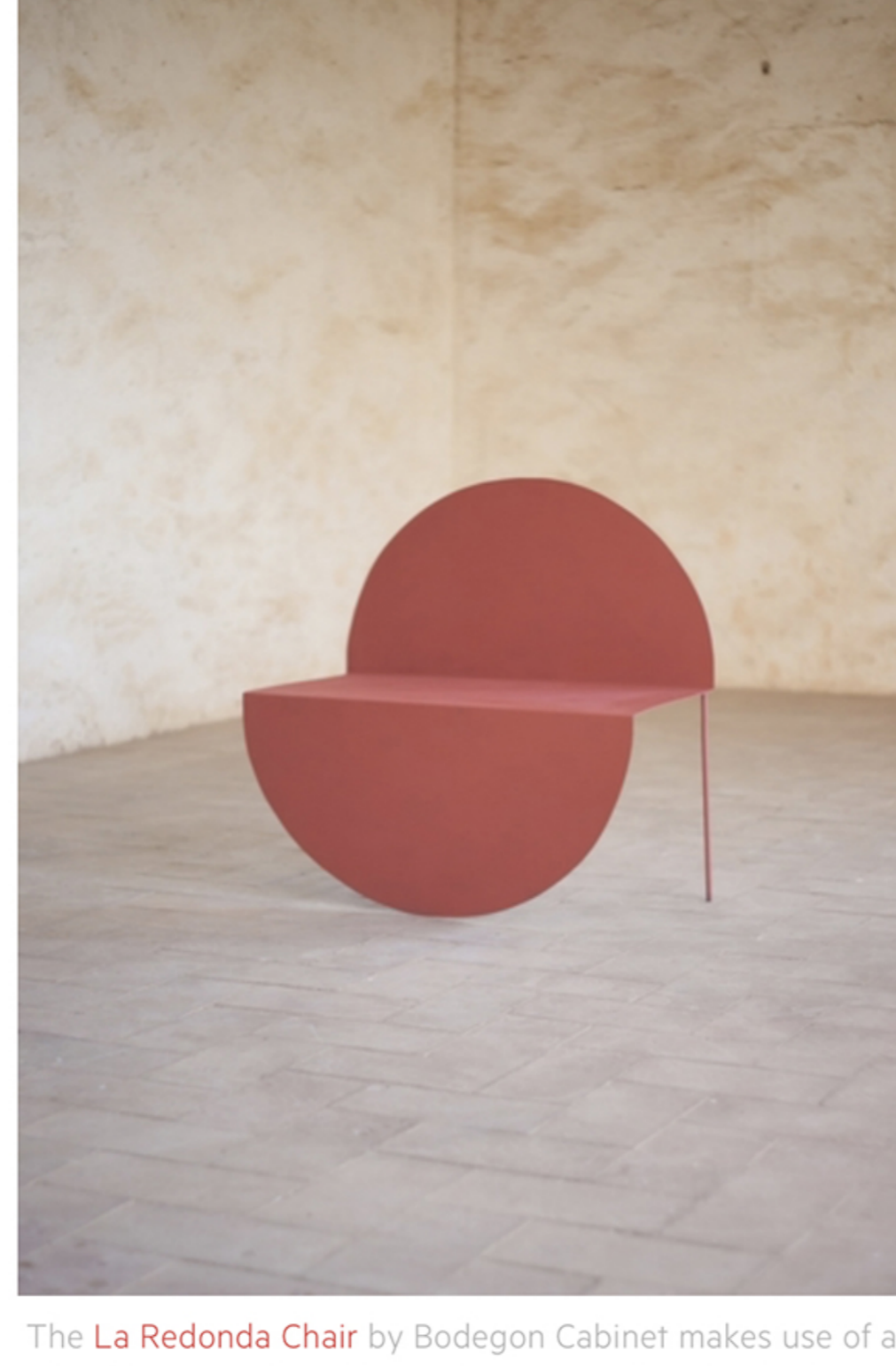
The La Redonda Chair by Bodegon Cabinet makes use of a familiar shape, bending and reconstructing the circle to make a simple yet elegant chair.

It's undeniable that creating virtual exhibitions widens the audience for upcoming designers, especially in the current climate, but Movimento believes, rather than working as a replacement, that virtual exhibitions should be created as complements to traditional physical shows. "We do, however, share the opinion that nothing virtual can ever truly replace the feeling of seeing art firsthand, so we don't expect that virtual exhibitions will replace physical exhibitions but perhaps will work side by side, for some events, to offer something extremely interesting," the studio told AD.