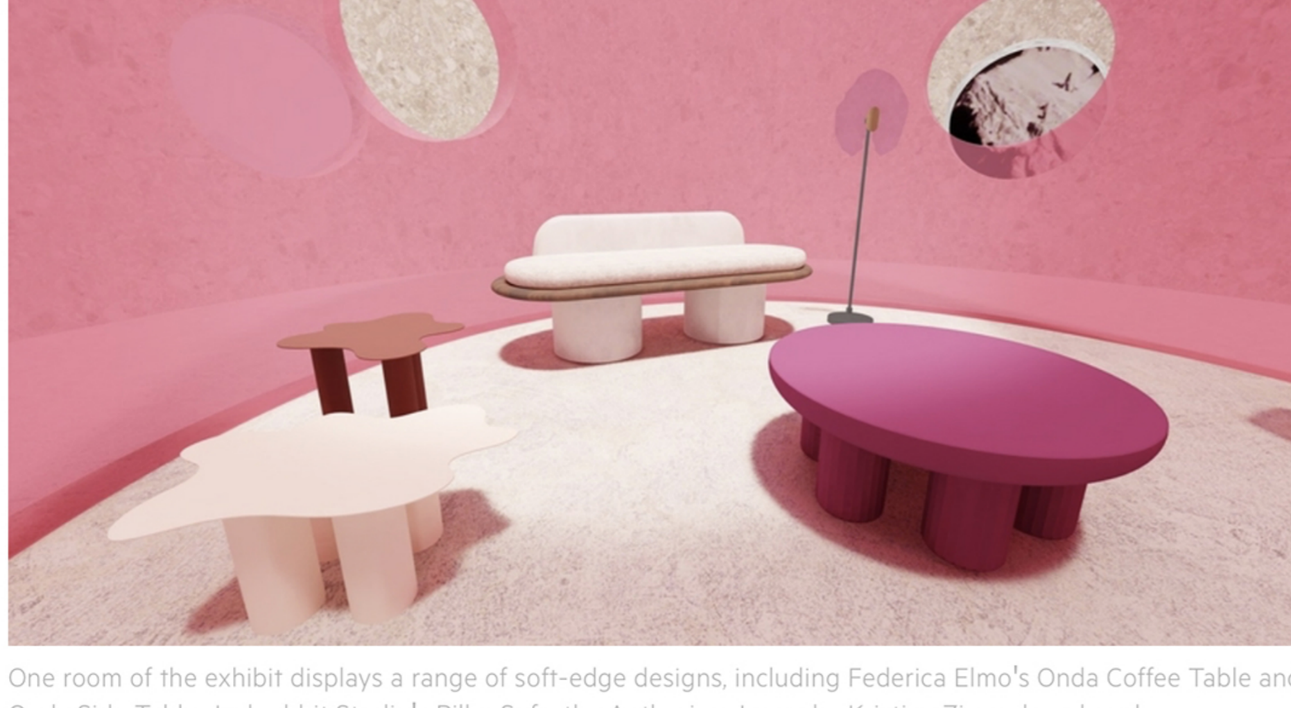
One room of the exhibit displays a range of soft-edge designs, including Federica Elmo's Onda Coffee Table and Onda Side Table, Jackrabbit Studio's Pillar Sofa, the Anthurium Lamp by Kristina Ziegenhagel, and Kalokagathos Table by Jiri Krejcirik.

It's hard to beat the feeling of walking into a gallery. The sense of quiet and reflection immediately transports you to another world, where you are able to slow down and focus on objects and work that push your mind and inspires your creativity. Unfortunately, during the pandemic, our access to these kinds of spaces is massively diminished, as art and design spaces work to support efforts to ensure public safety. Through all of this, creativity and ingenuity in the gallery world has still managed to flourish, reframing the way we think about sharing and displaying design.