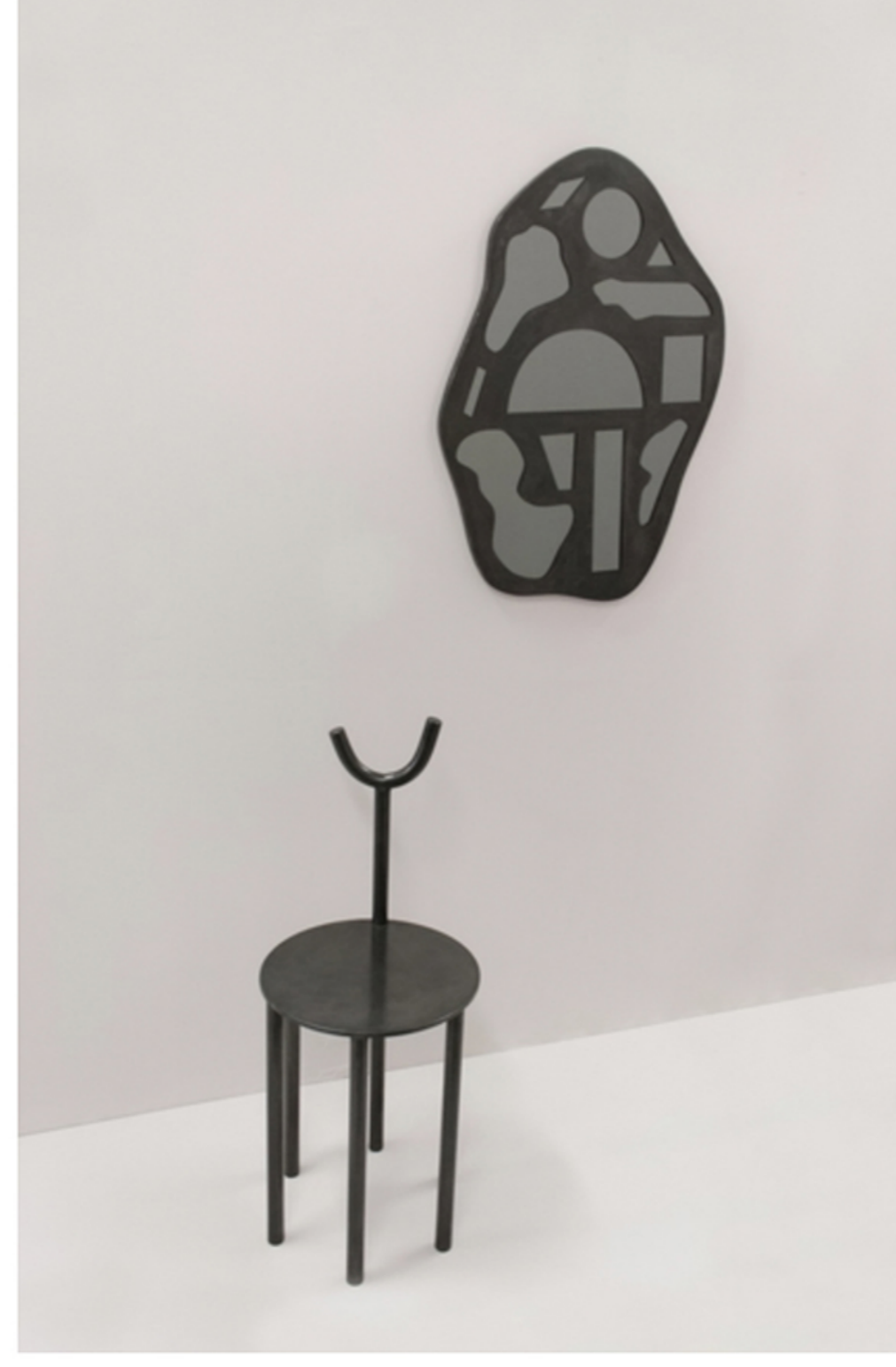
A closer look at the Room for Irregularities Chair by Glasgow-based Studio walac , shows the hand-blackened and waxed steel design is intended to promote irregularities within the final product.

With a somewhat uncertain future, virtual reality exhibitions may offer the promise of a new normal for design spaces, especially for young designers who are just beginning to share their work with a larger audience. "We see so many benefits with creating virtual exhibitions," shared Artefatto, "if you consider the cost and environmental impact of flying hundreds of pieces of art, or furniture in this case, to one location followed by thousands of people from around the world. [This] paired also with the exclusivity involved in only being able to visit an exhibition if you can afford to get to wherever it is being put on, be that for opportunity or money."