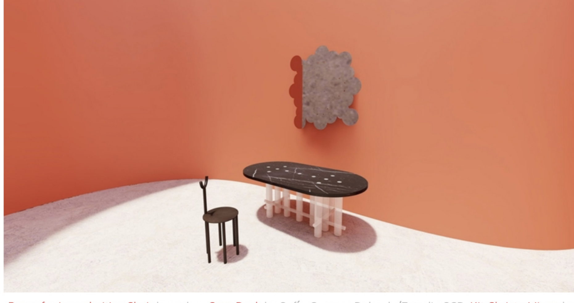
Room for irregularities Chair by walac, Crux Desk by Sofia Campos Delgado/Estudio SCD, Kit Christo Mirror by Asata.

One of our favorite parts of the exhibition was the way in which working within VR allowed the gallery's designers to create spaces that not only were pleasing to the eye, but also were far more expansive and radical than what typical white wall galleries usually stage. In one room undulating, deep orange walls curve to frame each vignette, while in another, a massive pink cylinder surrounding the design pieces reaches several stories high toward the open sky at the top of the chamber. As you pass through the gallery, you catch small glimpses of an extraterrestrial landscape just outside the walls, suggesting that there is something otherworldly about the whole experience.